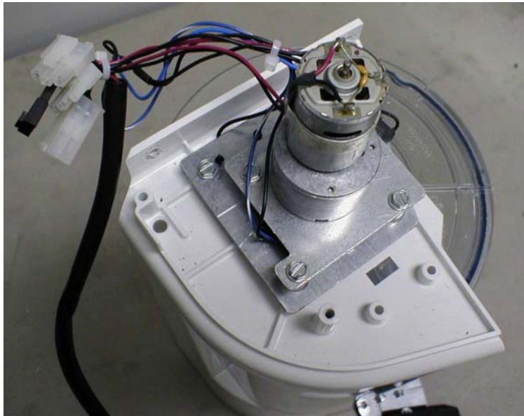
Used on PC/Gen. BevMax 2 and BevMax 3 prior to 8631-0053 647,053,90x.x3 (original with LED & switch assembly)